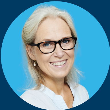
Persona Name: Networker Nicole

In the same way that you can provide a nonprofit author persona for your AI tool to adopt, you can provide a donor persona for it to write to (see the example below). A donor persona is basically a model for one of your target donor segments, like upper-middle-class adults who are active in community philanthropy, for example.